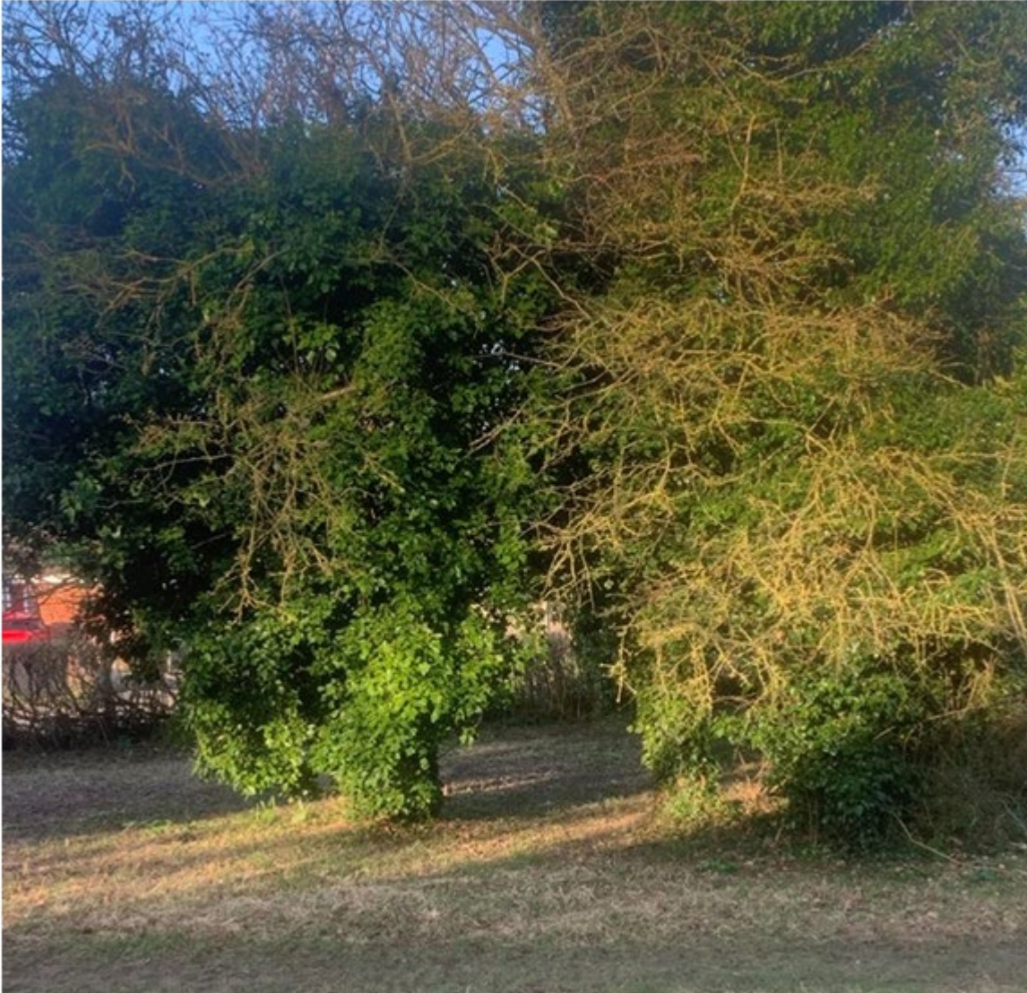
Figure 1 Over Run Trees- Ivy